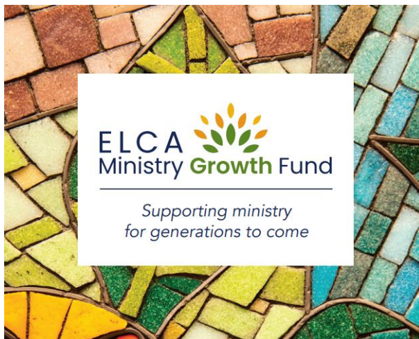
ELCA Ministry Growth Fund Brochure